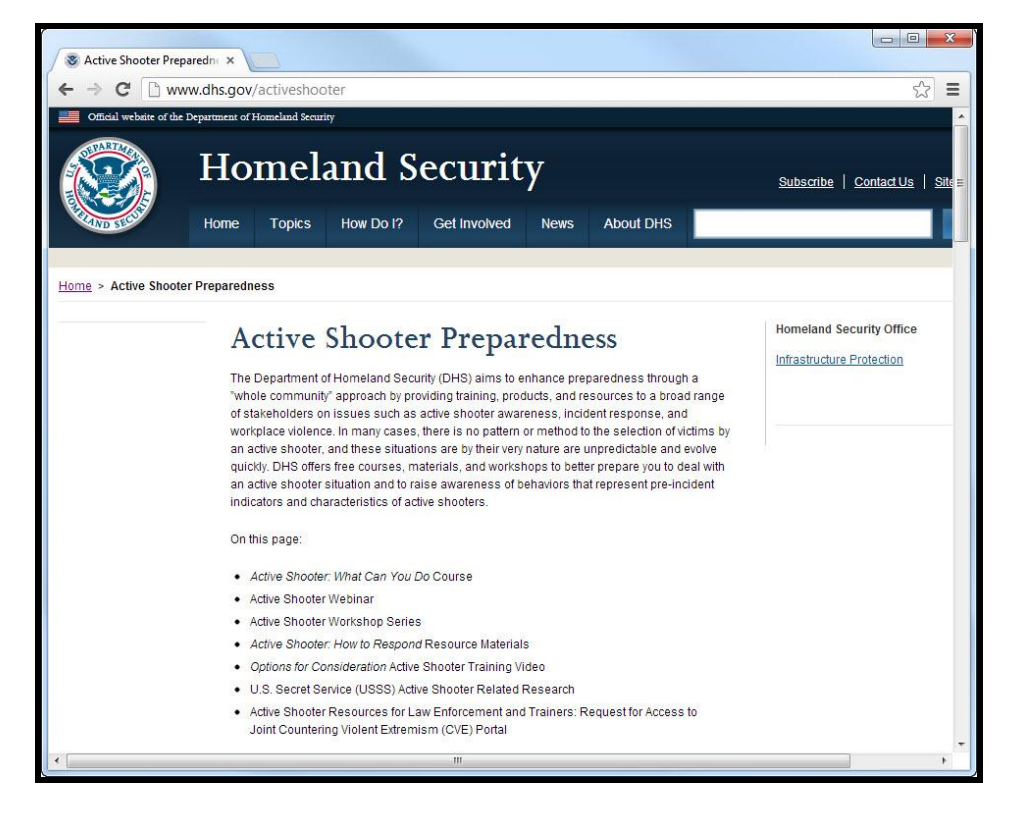
Figure 4. US DHS Active Shooter Preparedness Website