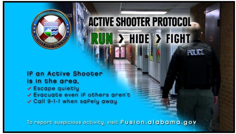
Figure 2. PSAs for "If You See Something, Say Something<sup>TM</sup>" and Run, Hide, Fight.