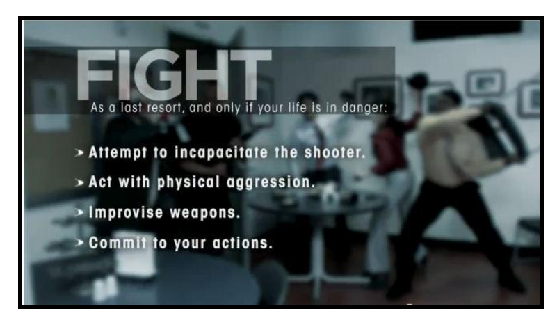
Figure 5. Scenes from Run, Hide, Fight