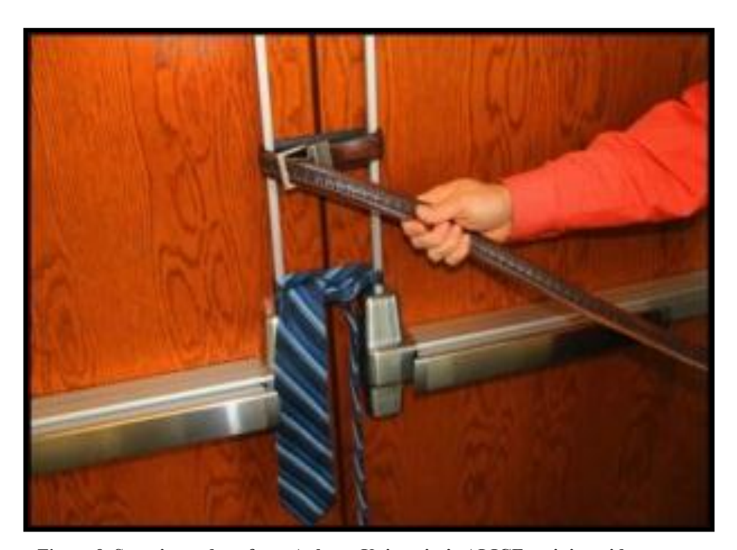
Figure 9. Securing a door from Auburn University's ALICE training video