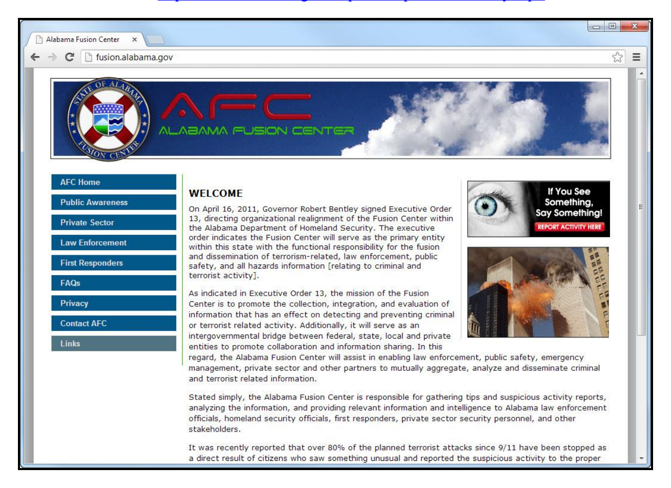
Figure 1. Alabama Fusion Center Home Page

• Online Form: <a href="http://fusion.alabama.gov/Report-Suspicious-Activity.aspx">http://fusion.alabama.gov/Report-Suspicious-Activity.aspx</a>